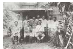
Local Employees at a farm